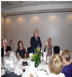
Members & Guests

We had a sumptuous meal at the Hilton and our special guest Kerry McCarthy, MP for Bristol East enjoyed relaxing and chatting with BPW members and other guests from across the region. We lit candles to commemorate BPW International's formation in 1930 and remembered our links around the world.